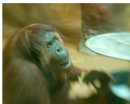
Borderless 11" x 14" Cropped

The size is up to the student, but should be no smaller than 11"x14." Prints should be either borderless or have a minimum of ¼" border evenly all around the image area. If you have uneven borders, i.e. full frame, use a ¾" boarder minimum for a 11" x 14" print; the minimum border is 1" on a 13"x19"