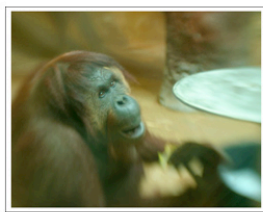
¼" Even Boarder 11" x 14" Cropped