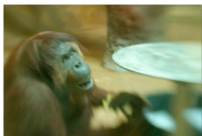
Borderless 12" x 18" Full Frame